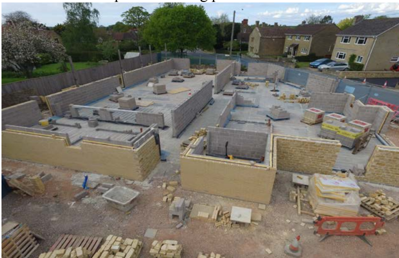
Photo 2. Showing brick and stone elevations