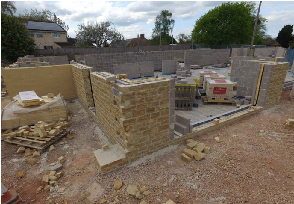
Photo 4 Showing stone and brick elevations