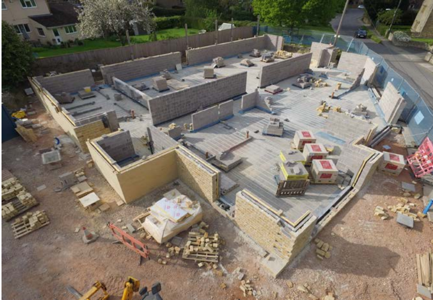
Photo. 3 View from above car park entrance looking across the site.