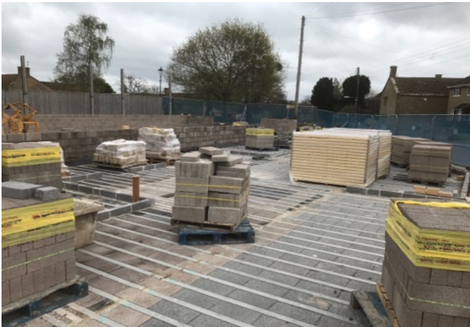
Photo. 3 Showing block & Beam installation wind posts to rear elevation & masonry

Telephone : 01458 273510 Fax : 01458 274619 VAT Reg. No. 944 5892 79 Email: max@edgarbuilders.com