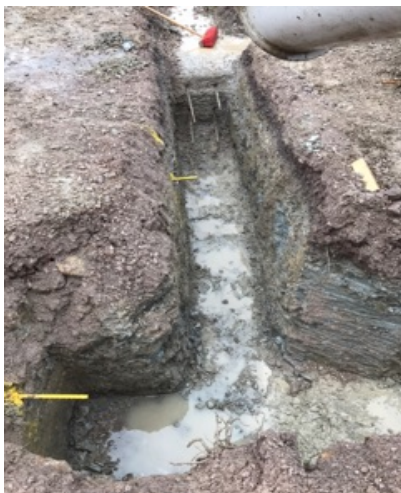
Photo 2. Last Foundation section being poured