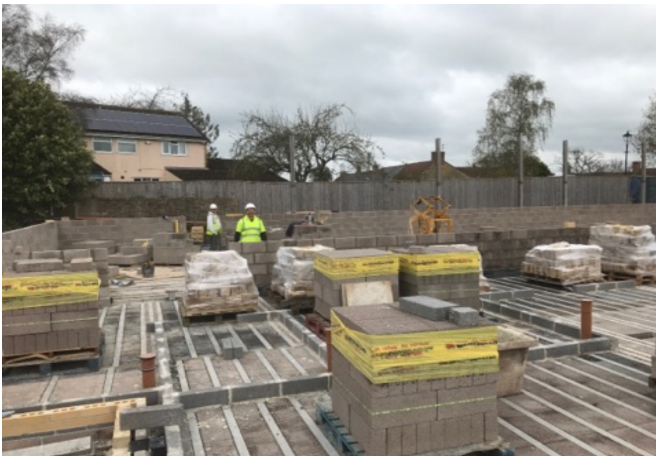
Photo 4 Masons building internal concrete block skin