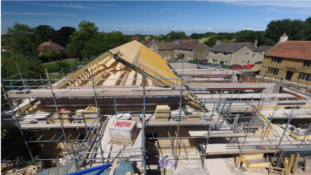
Photo. 3 View from the site office showing gable wall construction under way

Telephone : 01458 273510 Fax : 01458 274619 VAT Reg. No. 944 5892 79 Email: max@edgarbuilders.com