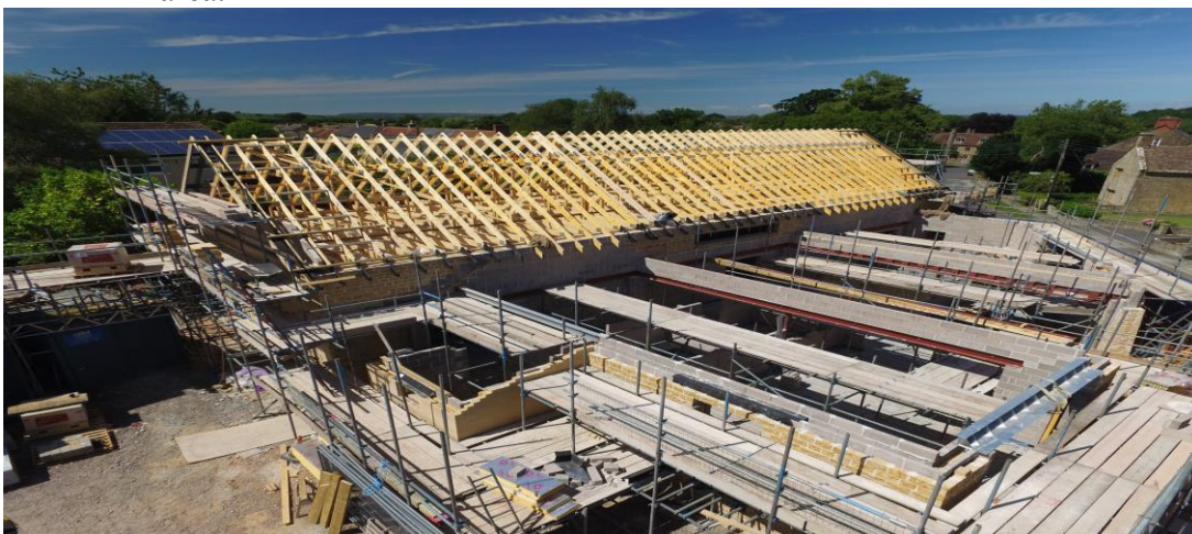
Photo 2. View across the building from over the site entrance