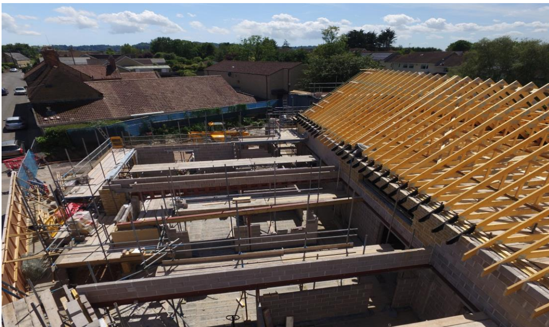
Photo 4. View from millennium green showing stained rafter ends & scaffold altered ready to receive second truss installation to two smaller roof sections this Wednesday