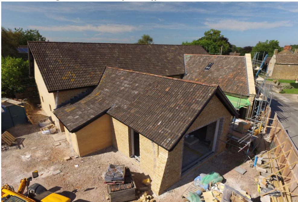
Picture 4. View from car park entrance after scaffold removal.