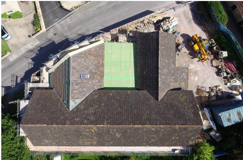
Picture 5. Aerial View