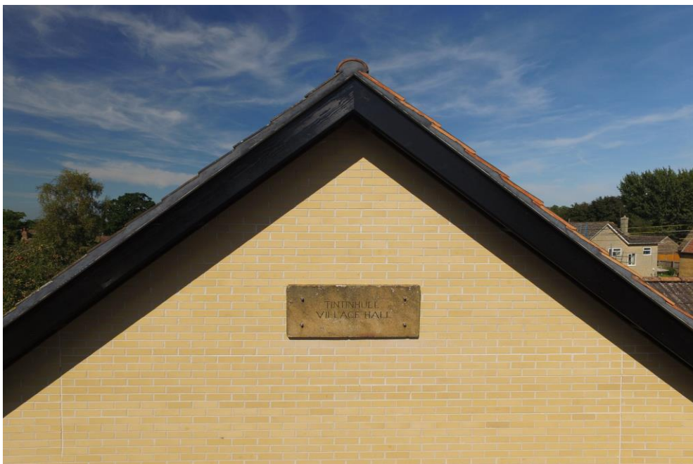
Picture 2. Reclaimed hall sign in position.