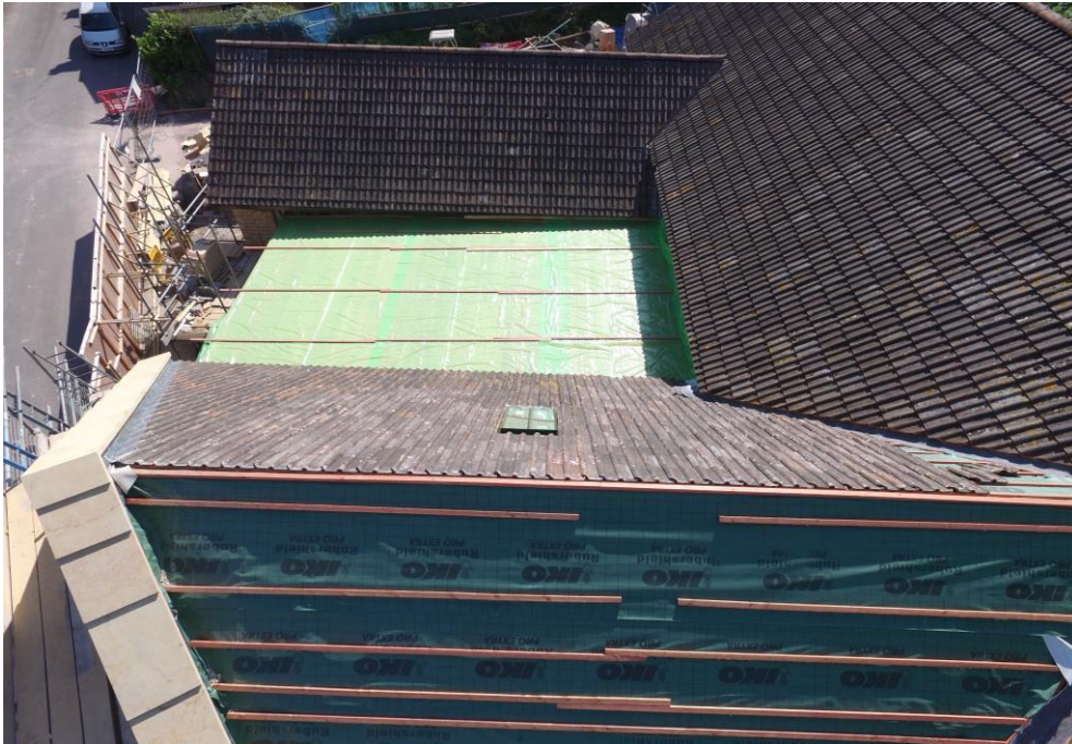
Picture 1 . Showing Roof Coverings