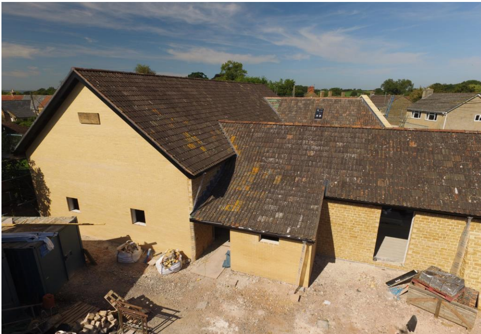
Picture 3. Carpark Elevation after scaffold removal