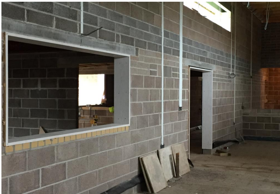
Picture 6. First fix electrical and door linings